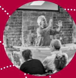
Eugenio Barba, Odin Teatret's 50th anniversary, September 2014