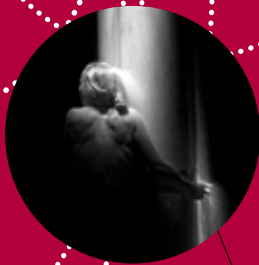
Armine, Sister Performance by Teatr ZAR, premiered in November 2013