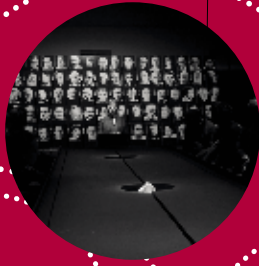
Mauser directed by Theodoros Terzopoulos as part of Masters in Residence, premiered in October 2013